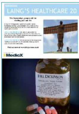
Pages from last year's brochure