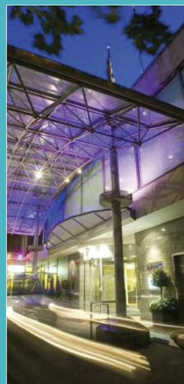
The Independent Healthcare Forum 2011 was held at the Radisson Portman Square, London. The 2012 venue will be confirmed shortly.

Price of the title sponsorship for the INDEPENDENT HEALTHCARE FORUM 2012 is available on request